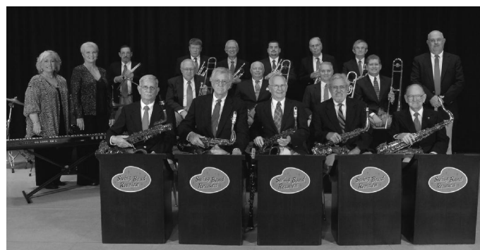
Swing Band Reunion in concert Sunday, October 9 2:30 PM Hicks Hall Free admission