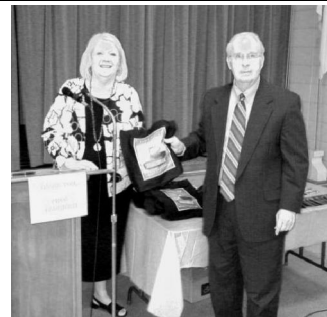
Teacher Appreciation September 4, 2011