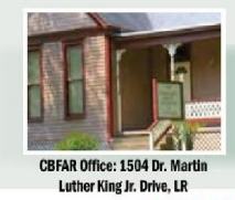
CBFAR Office: 1504 Dr. Martin Luther King Jr. Drive, LR